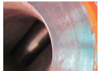
No Corrosion with ALKY-ONE