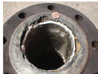
Severe Flange Corrosion